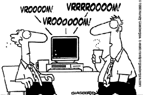
"We couldn't afford faster computers, so we just made them sound faster."