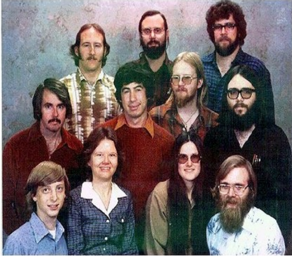
Microsoft Corporation, 1978